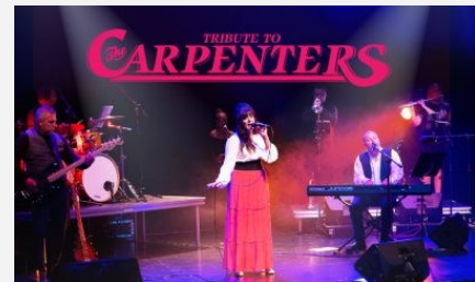
A Tribute to The Carpenters. Tickets from £29

20TH MARCH 2020 at the Brentwood Centre . Call Box Office